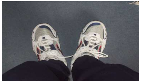
Are these feet female?