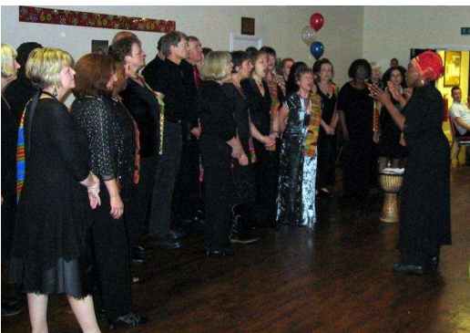
The Amika Choir